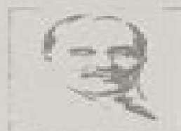
H. G. WELLS

IN AMERICA—Selected by The Book-of-the-Month Club