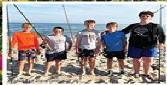
Stand by Me... see page 5