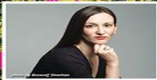
Magical Realism of Katherine Howe... see page 4