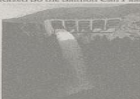
The building is the headquarters of the Federal Reserve Bank of New York. It is located in New York City and is one of the most important financial institutions in the world.

NEW YORK, July 14 — The fight against smoking has taken a new turn as the focus shifts from cigarettes to cigars. Cigars have long been considered a less harmful alternative to cigarettes, but recent studies have shown that they can be just as dangerous. The health authorities are now warning people to stop using cigars as well. The fight against smoking is still ongoing, and the health authorities are working to educate people about the dangers of all tobacco products. They are also working to provide support for people who are trying to quit smoking.