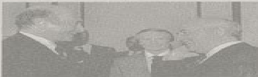
U.S. and Russian leaders met in Moscow to discuss the possibility of a new treaty on arms control. The treaty would limit the number of nuclear warheads each country could possess.