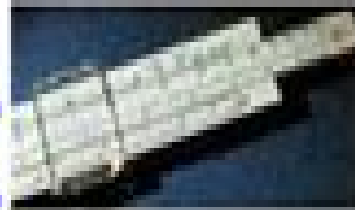
Slide rule - 1617 Mechanical calculator - 1642 Automatic loom (punched cards) - 1804