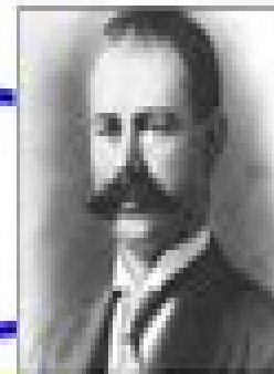
Hollerith's electric tabulator - 1890 Analog computer - 1927 EDVAC - 1946 ENIAC - 1947