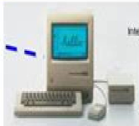
Integrated circuit - late 1950s UNIVAC - 1951 Microprocessor - 1971 Altair 8800 - 1975 Apple II - 1977 IBM PC - 1981 World Wide Web - 1990s