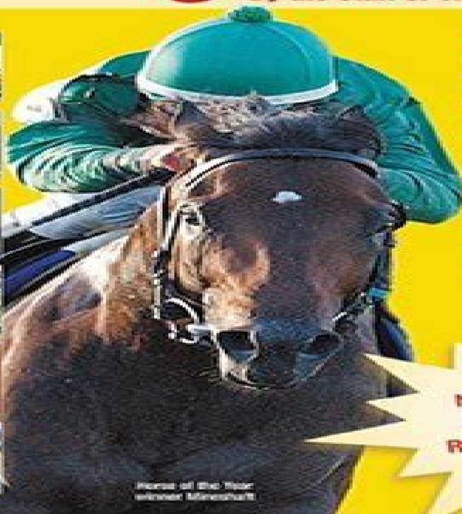
Horse of the Year winner Minershaft

TRIPLE CROWN BREEDERS' CUP TRAINERS, JOCKEYS TRACK DIRECTORY STAKES HISTORIES ECLIPSE AWARDS STATE OF THE INDUSTRY HANDICAPPING BREEDING SIRE AUCTIONS HISTORY OF RACING