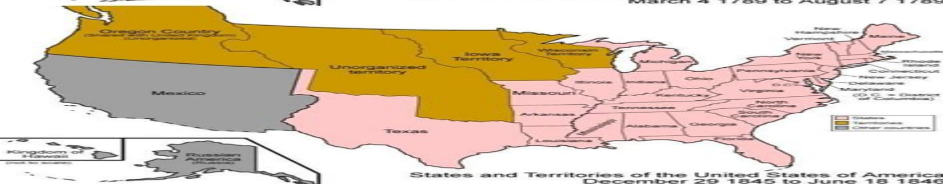
States and Territories of the United States of America December 29 1845 to June 18 1846