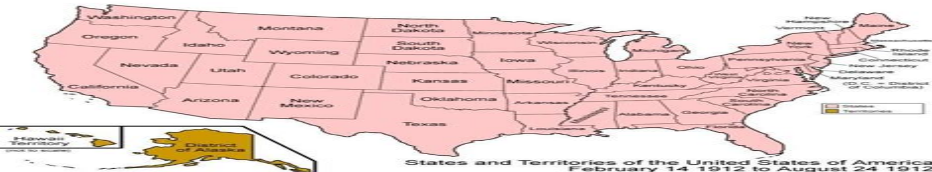
States and Territories of the United States of America February 14 1912 to August 24 1912