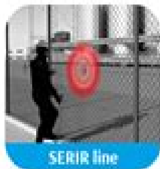
Protection of flexible metal fences