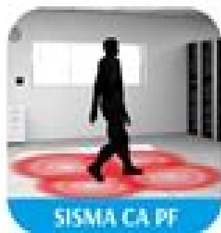
Protection of raised floors