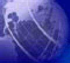
Figure 3.4 Environments and organizations have a reciprocal relationship.