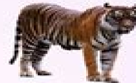
Sunda Island Tiger