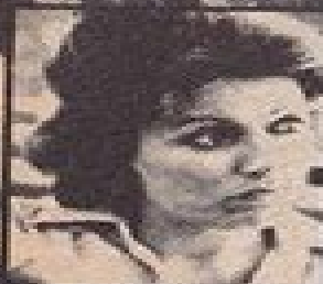
PATTY DUKE ASTIN