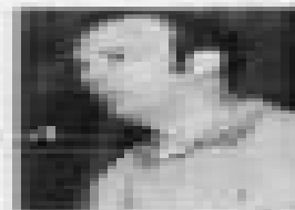
Modesto teacher, left, and student, right.