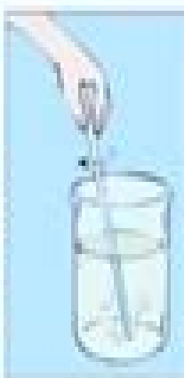
(b) Dissolving the sample in water