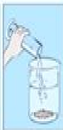
(c) Adding a suitable chemical to form a precipitate