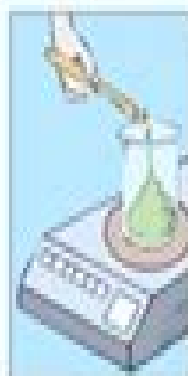
(a) Weighing the sample to be analysed