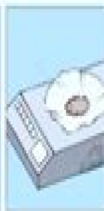
(e) Repeated drying and weighing until a constant mass of precipitate is obtained