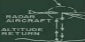
SIMPLIFIED PERIMETER OF ELEVATION SIDE-LOBE PATTERN

MAIN BEAM TARGET AIRCRAFT GROUND CLUTTER