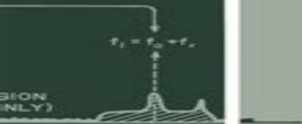
OF LOW-BAND PASS FILTERS

MAIN BEAM TARGET AIRCRAFT GROUND CLUTTER