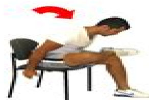
GLUTEAL & ABDUCTORS