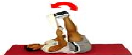
CALVES, HAMSTRINGS & LOW BACK