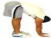
HAMSTRINGS & LOW BACK

⚠️ Consult a physician before starting any stretching regime. This chart is for informational purposes only.