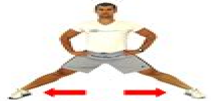
GROIN & ADDUCTORS