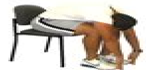
GLUTEAL & LOW BACK

• Hold each stretch for 15-30 sec • Stretch slowly • Stop if you feel pain