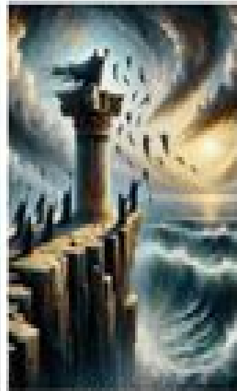
ETHICAL LEADERSHIP FAILURE