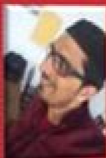
By Hathib k.k.