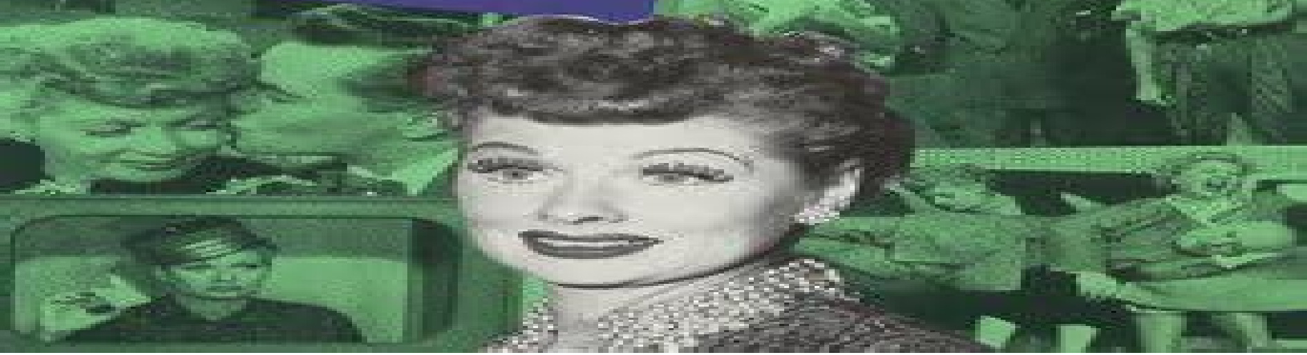
LUCY AND DESI