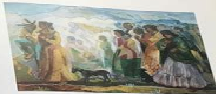
15. Lloyd Meylan, Indian Communal , watercolor, 19 x 24-1/2 in.