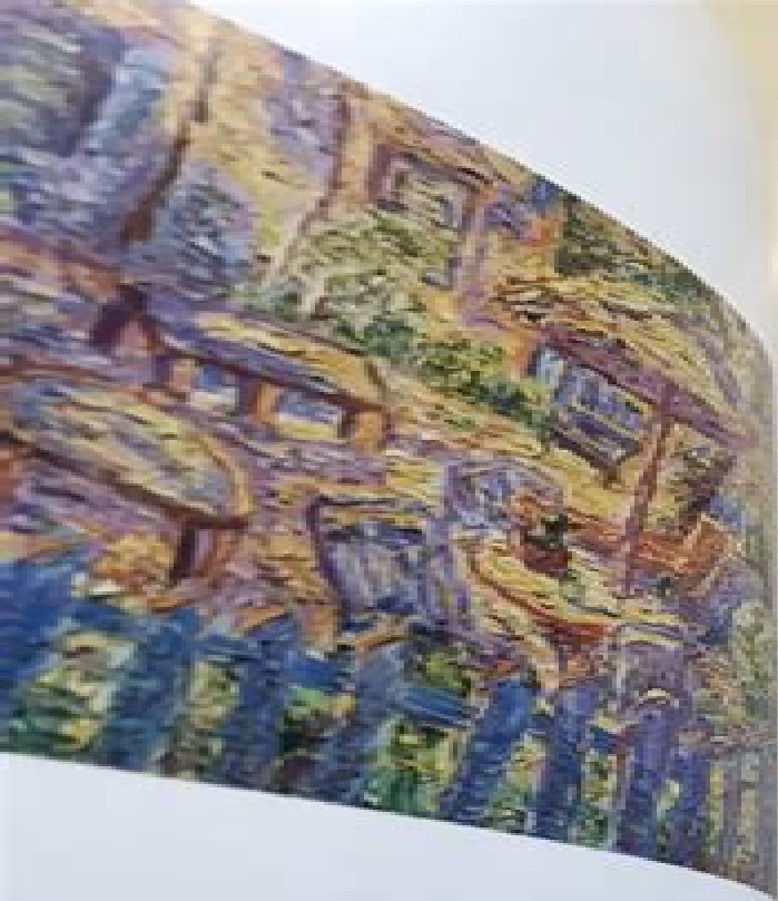
Courtyard , 1948, oil on canvas, 11 x 15-1/2 in.