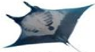
Giant Manta Ray