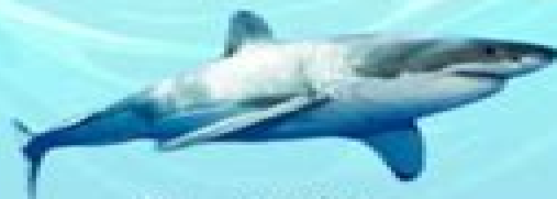
Great White Shark