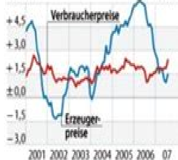
Preise Prozent 4