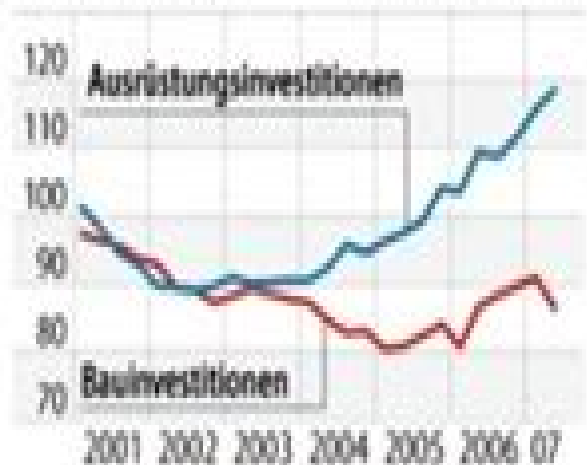
Investitionen Index, 2000=100