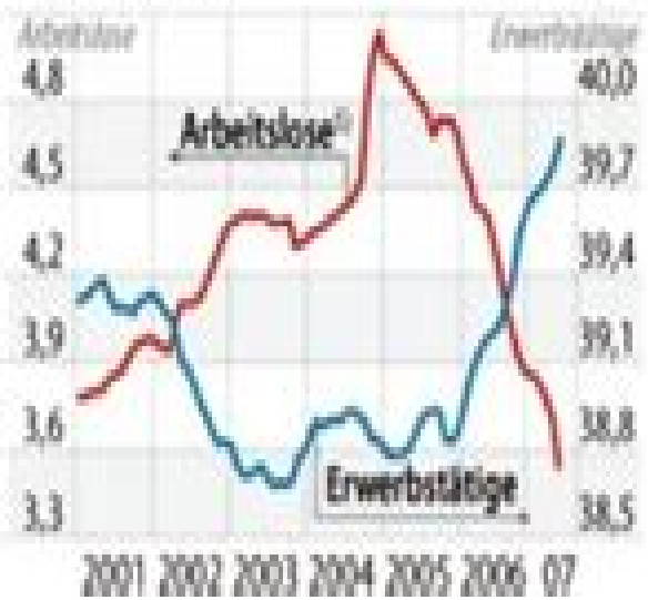
Arbeitsmarkt Millionen 3