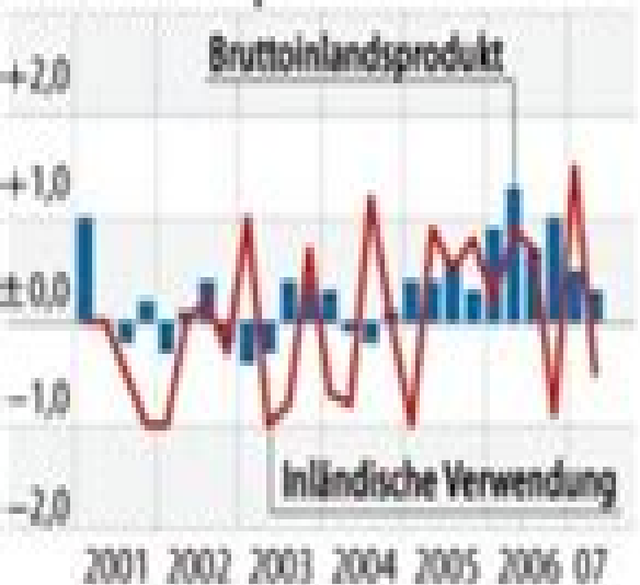
Bruttoinlandsprodukt Prozent 3a