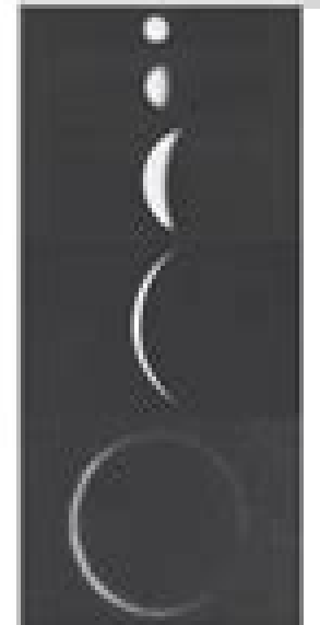
Phases of Venus: Size would be constant in a geocentric system.