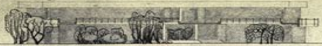
Scenario agli Interni

(colorati in alcuni le fioriture di Cr. Au. Mts e Cydonus - adirati in pianta e alcuni i restanti al bucci e rampugli) -