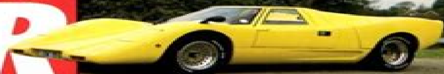
McLAREN M6GT REPLICAS- TORNADO

• '55 FORD T-BIRD • PUMA CONVERTIBLE • PLUS, MORE KIT CARS YOU CAN BUILD!