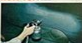
HOW TO: PAINT