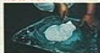
HOW TO: FINISH