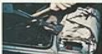
HOW TO: STRAIGHTEN