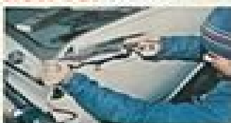
HOW TO: FILE