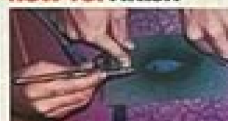
HOW TO: DETAIL