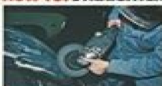
HOW TO: GRIND