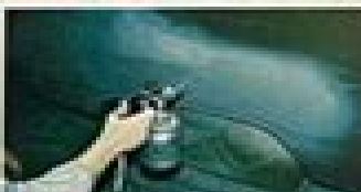
HOW TO: PAINT