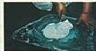
HOW TO: FINISH