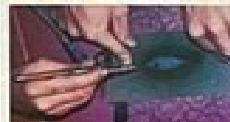
HOW TO: DETAIL