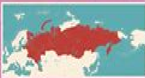
THE RUSSIAN EMPIRE, c. 1725