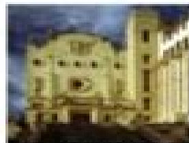
Church of San Mateo in Mexico The Church of San Mateo in Mexico