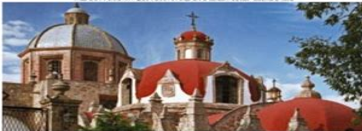
Church of San Mateo in Mexico The Church of San Mateo in Mexico

ENCUENTRA POR AQUÍ AGOSTO AL CON LA CHÉ HOYNO SEÑORAL QUAJO - DICIEMBRE 1999