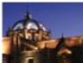
Church of San Mateo in Mexico The Church of San Mateo in Mexico