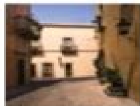
Church of San Mateo in Mexico The Church of San Mateo in Mexico