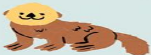
1 SEA OTTER