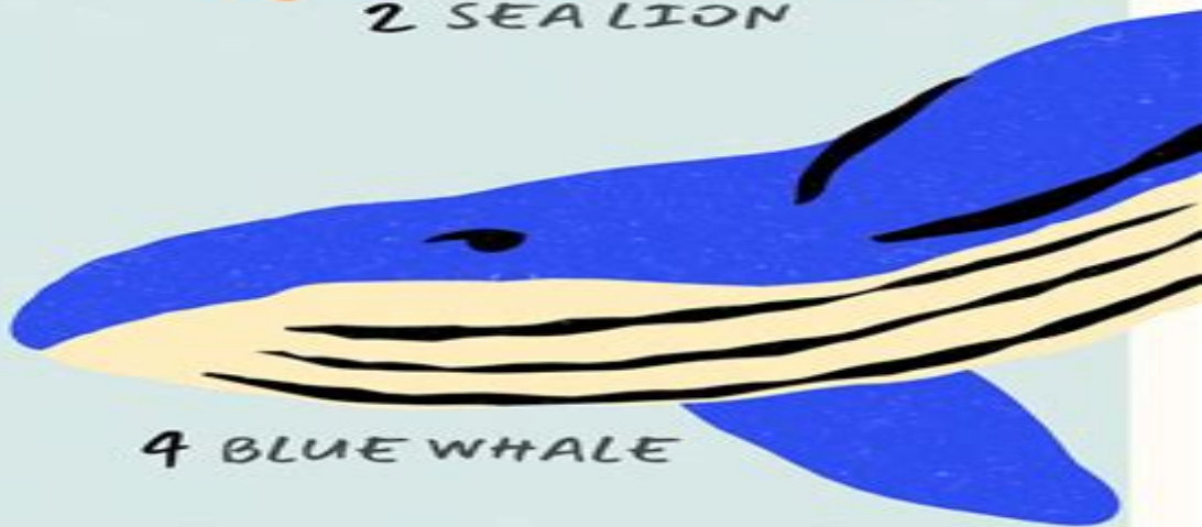
4 BLUE WHALE