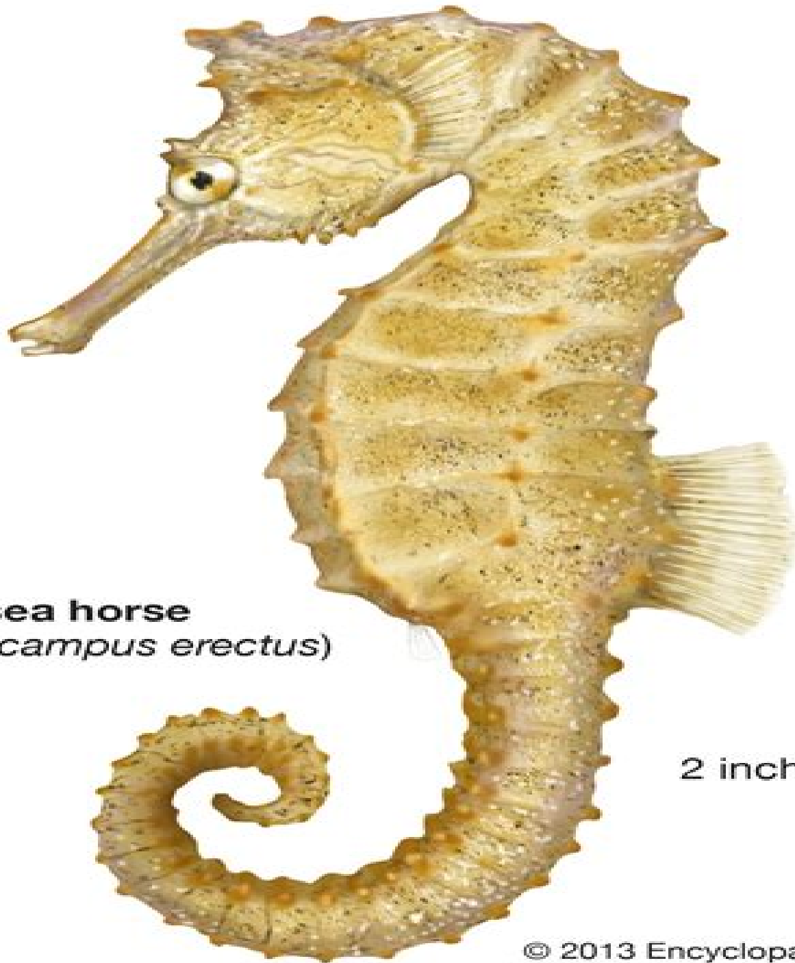
lined sea horse ( Hippocampus erectus )