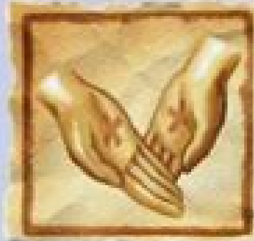
Anointing of the Sick