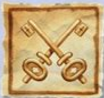
Penance and Reconciliation