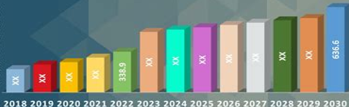
MARKET SIZE USD BN