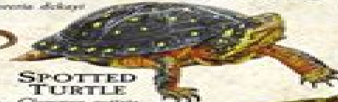
SPOTTED TURTLE Chelydra punctata