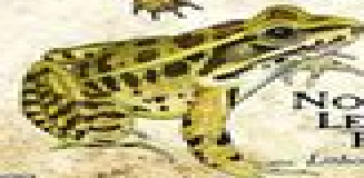
NORTHERN LEOPARD FROG Lithobates pipiens