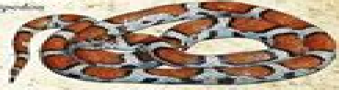
EASTERN MILK SNAKE Lampropeltis triangulum triangulum