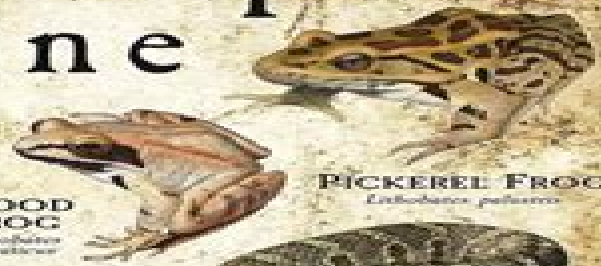
PICKEREL FROG Lithobates palustris