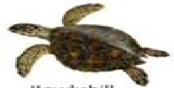
Hawksbill Sea Turtle