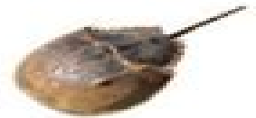
Atlantic Horseshoe Crab