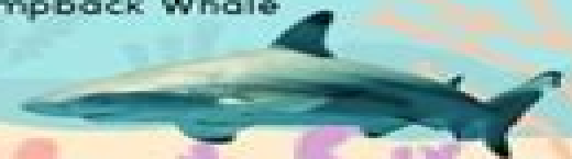
Blacktip Reef Shark