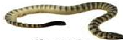
Shaw's Sea Snake