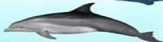
Common Bottlenose Dolphin