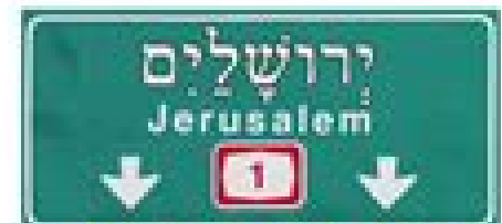
Modern Hebrew www.bible.co/manuscripts