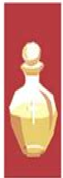
Anointing of the Sick