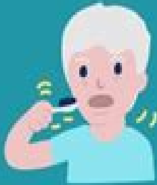
Slow movements (bradykinesia)