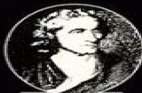
JOHN LOCKE 1632 - 1704