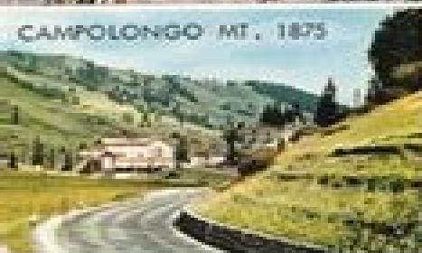
CAMPOLONGO MT. 1875