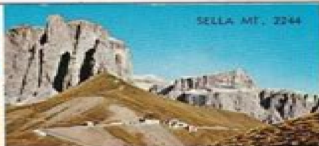
SELLA MT. 2344