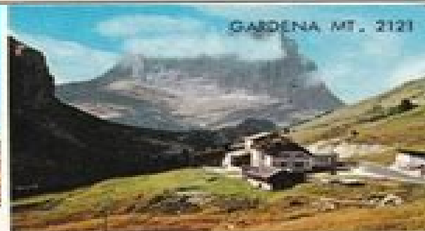
GARDENA MT. 2121