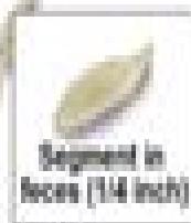
Segment in feces (1/4 inch)