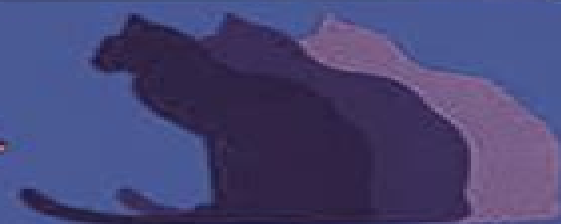
So Many Cats