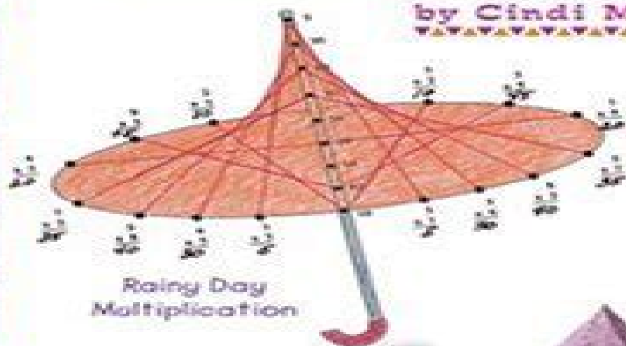
Rainy Day Multiplication