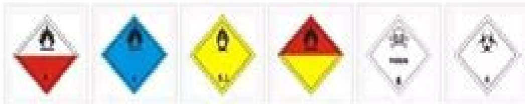
7. Spontaneous combustion 8. Corrosive 9. Irritant 10. Organic peroxide 11. Poison 12. Infectious substance