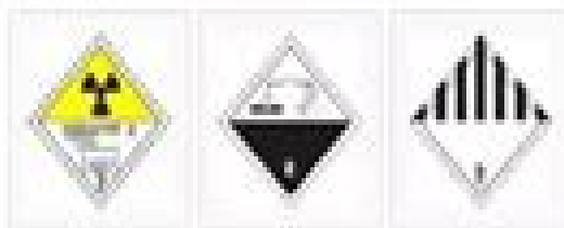
13. Radioactive 14. Corrosive 15. Hazardous waste