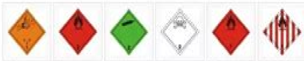
1. Explosive 2. Flammable gas 3. Oxidizing gas 4. Poison gas 5. Flammable liquid 6. Flammable solid