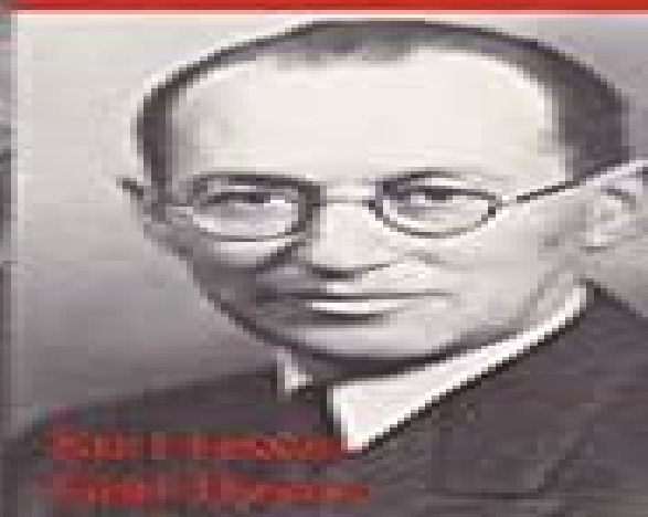
Kurt Lewin Group Dynamics