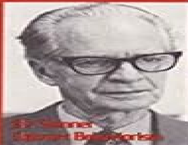
Sigmund Freud Psychoanalysis