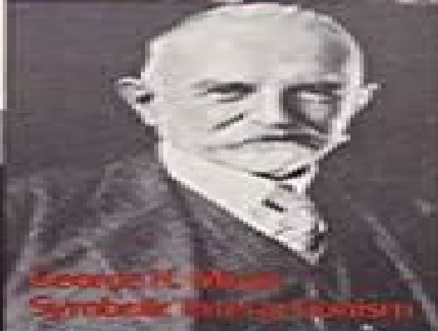
George K. Mandler Symbolic Interactionism