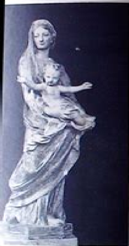
Virgin and Child, 16th century. From the collection of the Monasterio de San Juan de los Rios, Burgos, Spain.