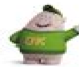
THE NAIVE ONE