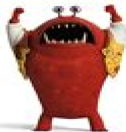
THE GYM RAT