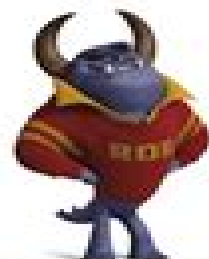
THE BIG MONSTER ON CAMPUS