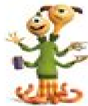
THE CONFLICTED ONE