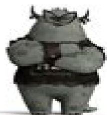
THE TOUGH ONE