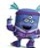
THE SPEED DEMON