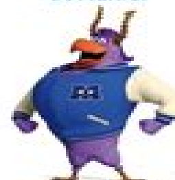
THE LOUD ONE