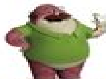
THE MATURE ONE