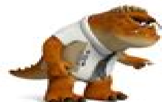
THE INTELLECTUAL ONE