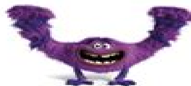
THE ODD BALL