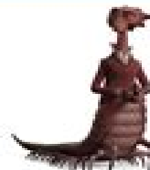
THE LIVING LEGEND