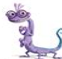
THE ELUSIVE ONE