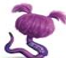
THE SHY ONE