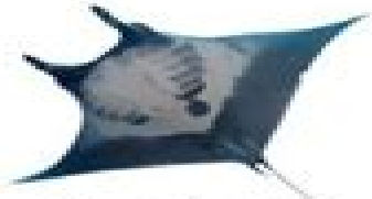
Giant Manta Ray