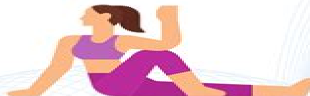
Seated Spinal Twist