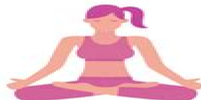
Sitting Pigeon Pose