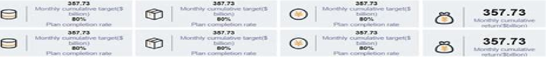
Sales target achievement trend chart