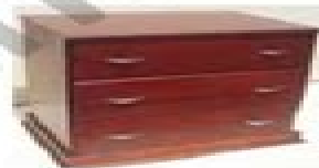
Chest of drawers