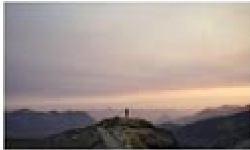
Extreme wide shot: Is used to show what surrounds the object