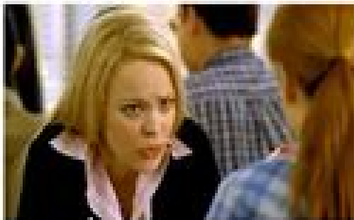
Over the shoulder shot: Establishes an eye line for the audience and can drop us into an intimate point of view