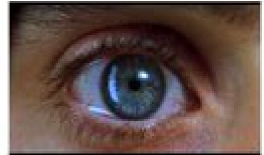
Extreme close up: Frames even tighter on the face which helps highlights facial features