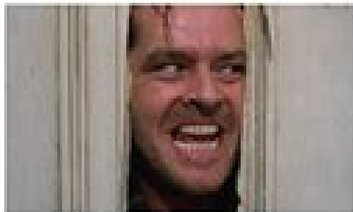
Close up: Frames characters face, which can help highlight emotion