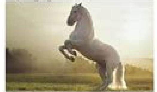
Full shot: Shows the object/person fully from head to toe