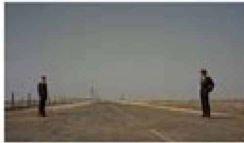
Wide shot: Shows the subject within their surroundings and tells the audience when and where the photo was set.