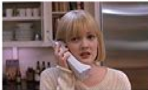
Medium close up: Frames subject from waist up